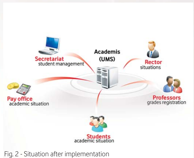
Fig. 2 - Situation after implementation

The presence of University Management System at the level of all secretariats in the university led to a rapid and visible improvement of all the aspects related to the management of students’ personal data and their academic situations. At the level of pay offices the system proved an easier and more coherent management and records of all the payments performed by the students, tax payments, as well as the automatic printing of the receipts during their registration.